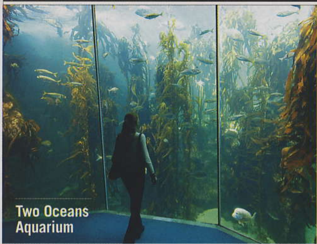
Two Oceans Aquarium

vibrant character all set against the stunning backdrop of Table Mountain.