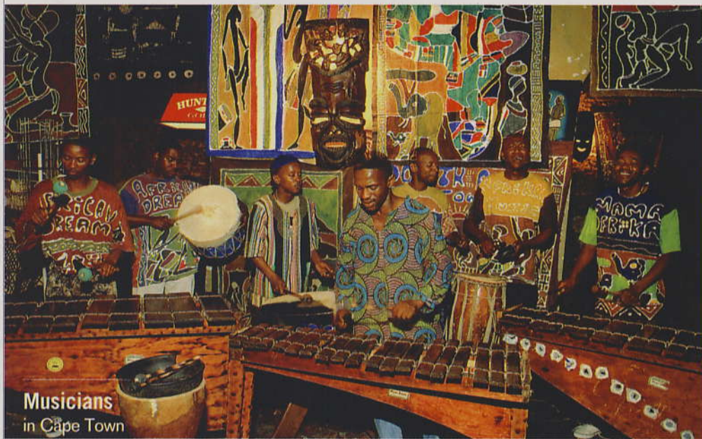
Musicians in Cape Town

To gain orientation, take a half-day city tour beginning with a visit to the city's most famous landmark, Table Mountain. Located in the heart of the city, the mountain offers some of the best climbing in the world and more than 550 hiking walks rich with flora and fauna. In fact, the mountain claims more diverse plants than the entire British Isles. Although hiking is spectacular, most tourists opt to ascend via cable car, which provides quick access to the vast views across Table Bay and the Atlantic. (Tip: Plan your visit for early morning when the lines are