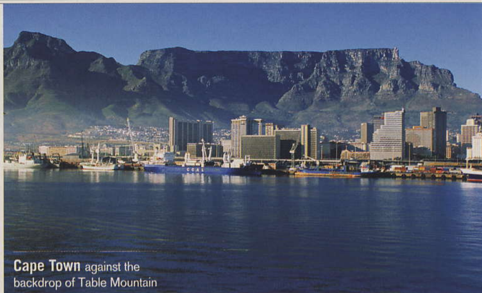
Cape Town against the backdrop of Table Mountain

To incorporate Cape Town into a larger African itinerary, consider Abercrombie & Kent's luxurious 14-day Southern Africa in Style package, which combines Cape Town with deluxe