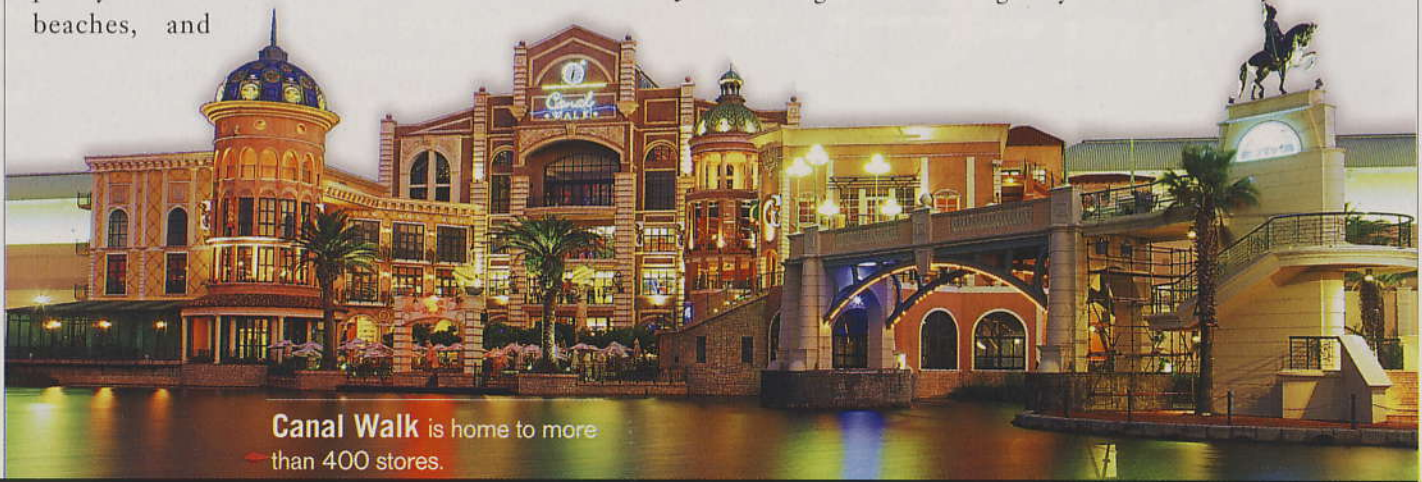
Canal Walk is home to more than 400 stores.

shortest and winds are weakest.) Cape Town's city center features multiple museums and historic buildings, including the Castle of Good Hope, which is the city's oldest building. Don't miss the Company's Garden, which was originally established as