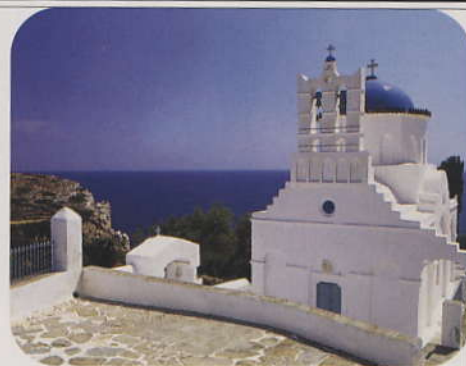
Sifnos offers travelers postcard-perfect images of Greece.

For a glimpse into Greece's archaeological history, don't miss the island of Delos, a 20-minute ferry ride away from Mykonos. Delos is truly an open-air museum, with history dating back to the island's first inhabitants in the 3rd millennium B.C. Considered the birthplace of Apollo, the island was both an important spiritual sanctuary and later a thriving Roman port—filled with splendid buildings and monuments, many of which are still intact. Devoid of hotels and only accessible during daylight hours, the island offers a fleeting glimpse into the grandeur at the height of Greek