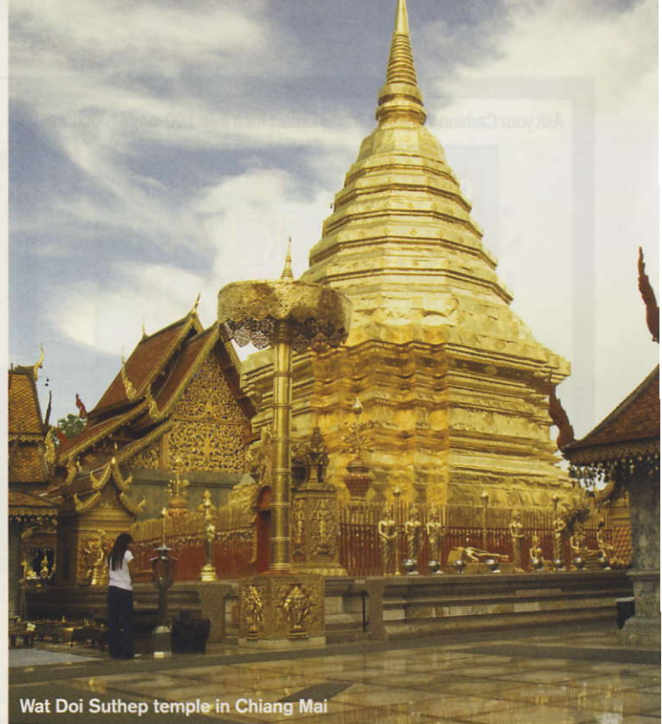
Wat Doi Suthep temple in Chiang Mai

Next, see the 600-year-old Wat Doi Suthep