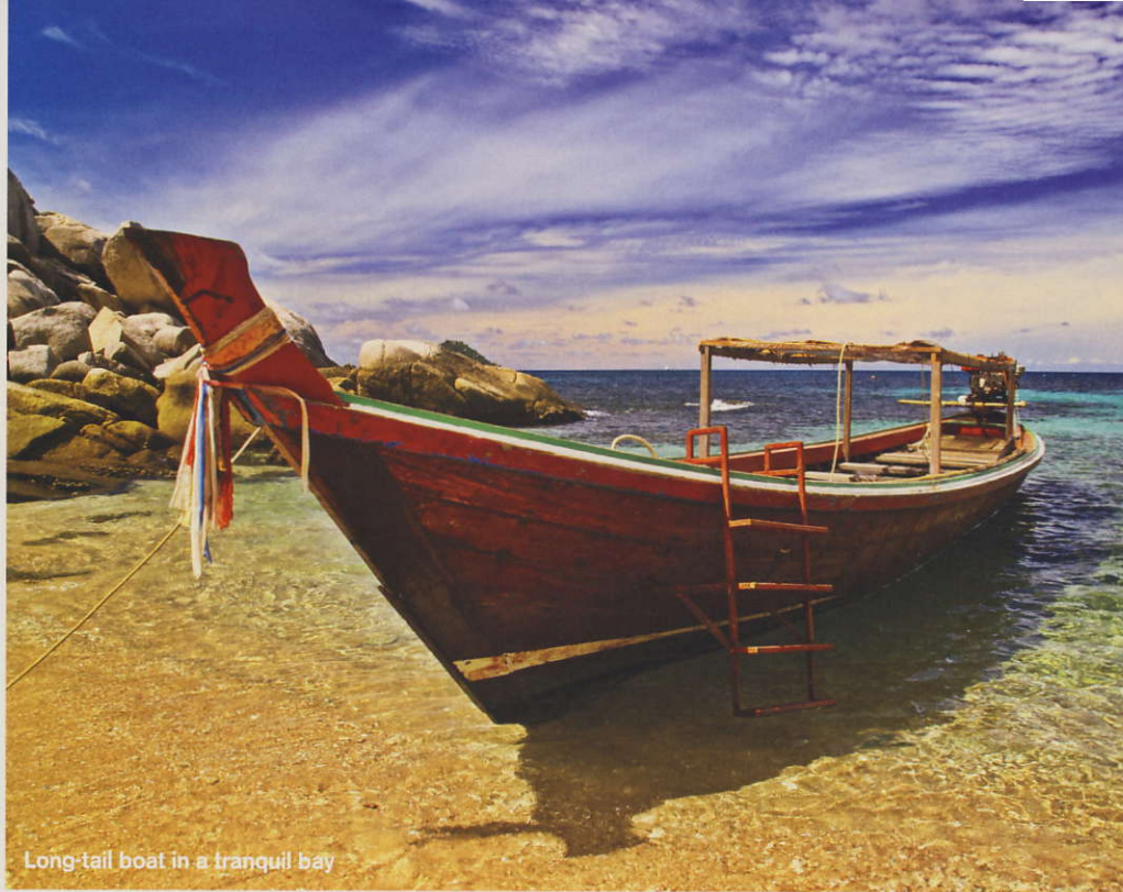
Long-tail boat in a tranquil bay